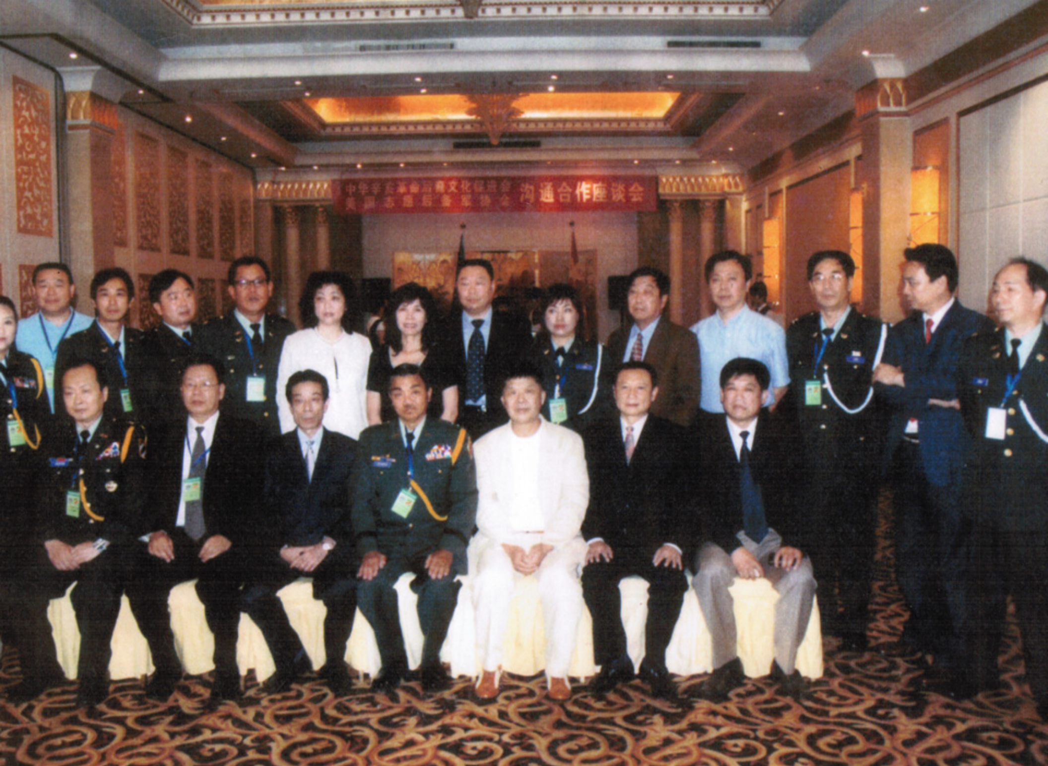
General Commander Earnest Tchang during his USAVRA unit's delegation visit to the People's Republic of China