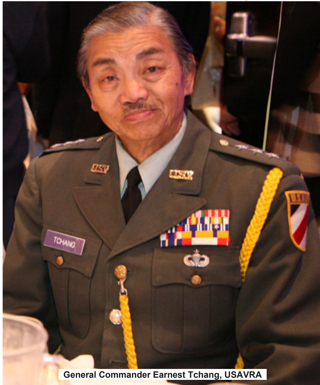
General Commander Earnest Tchang, USAVRA