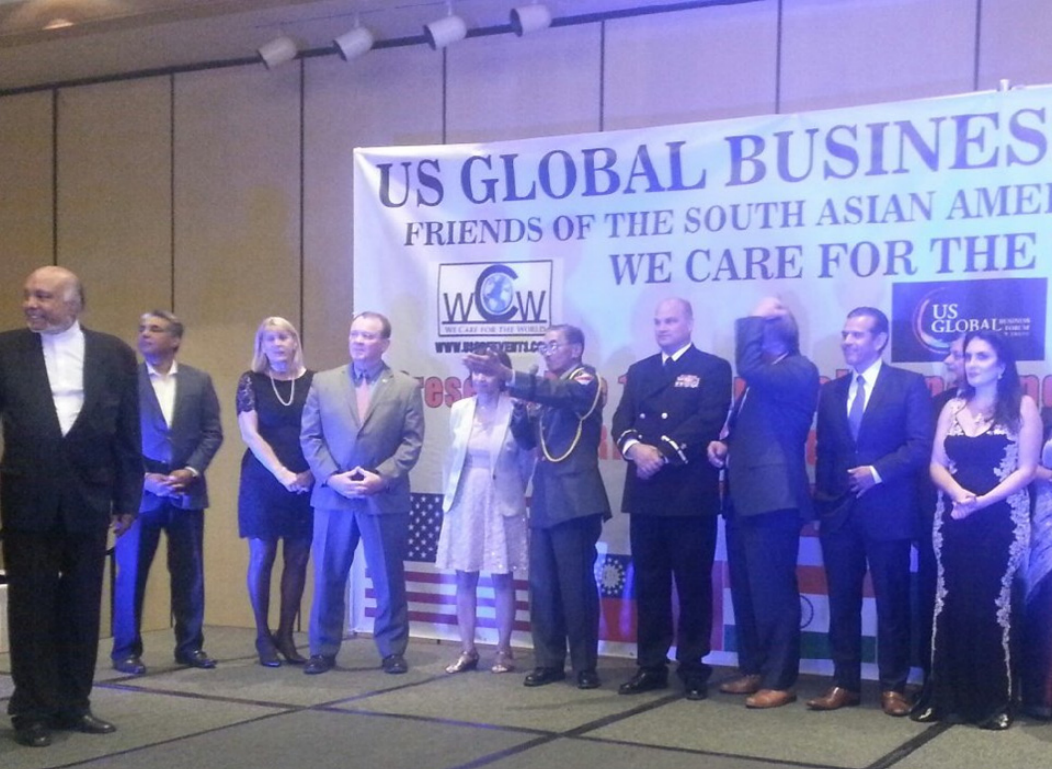
General Commander Earnest Tchang addresses the attendees of the U.S. Global Business Forum Conference at the Sheridan Hotel in Artesia, CA